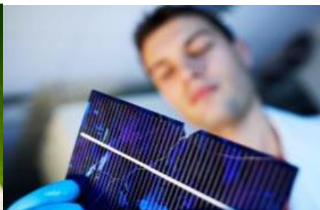
Grenoble INP - Phelma, UGA Physics, Electronics, Materials Sciences 物理、电子和材料物理学院