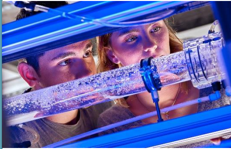
Grenoble INP - Ense 3 , UGA Energy, Water & Environmental Sciences 能源、水资源和环境科学学院