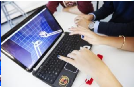
Grenoble INP - Ensimag, UGA Applied Mathematics & Computer Sciences 应用数学和计算机科学学院