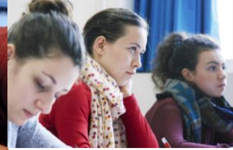
Grenoble INP - Génie industriel, UGA Industrial Engineering & Management 工业工程和管理学院