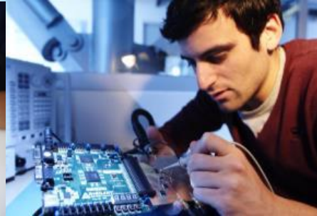
Grenoble INP - Esisar, UGA Advanced Systems & Networks 高级信息系统和网络学院