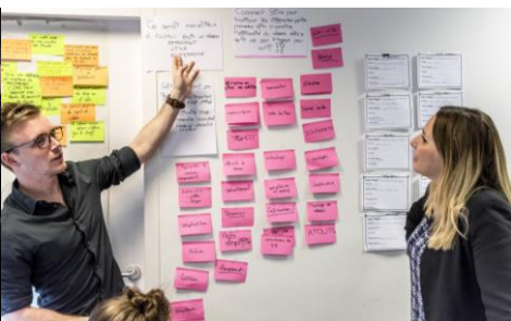
Grenoble IAE - INP, UGA Graduate school of management 管理学院