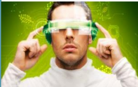
Grenoble INP - Pagora, UGA Paper, print Media & Biomaterials 造纸、印刷与生物材料学院